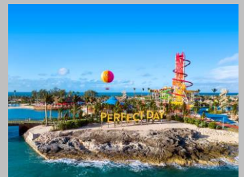
PERFECT DAY AT COCO CAY, BAHAMAS