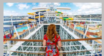
ENDLESS FUN ON BOARD!!!