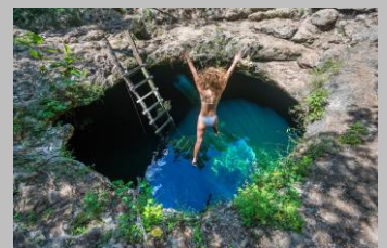
PUERTO COSTA MAYA, MEXICO